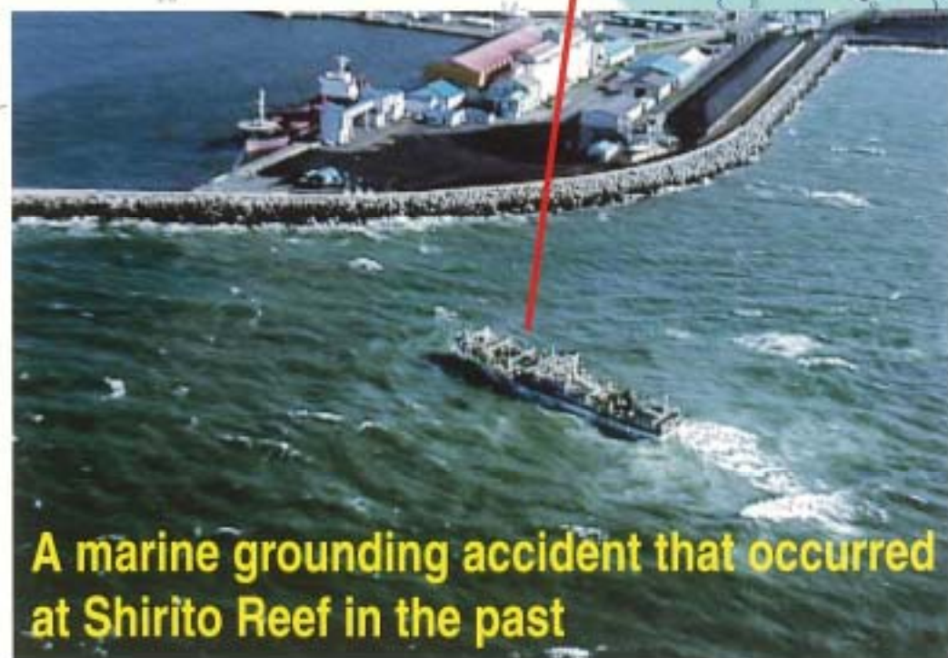
A marine grounding accident that occurred at Shirito Reef in the past